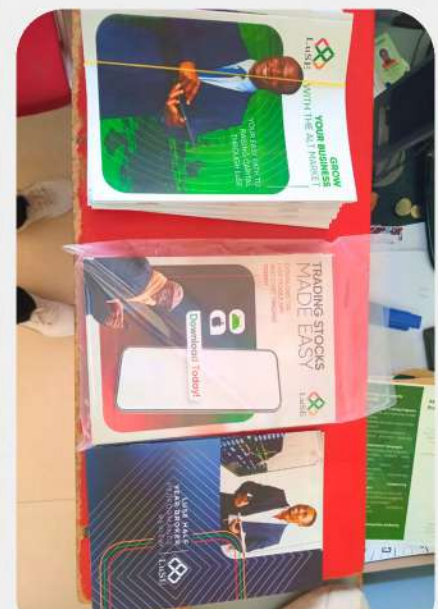
Lusaka Securities Exchange LuSE