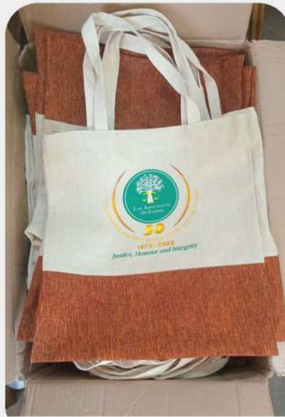
Law Association of Zambia LAZ

300+ Tailor-made Tote Bags (actual image)