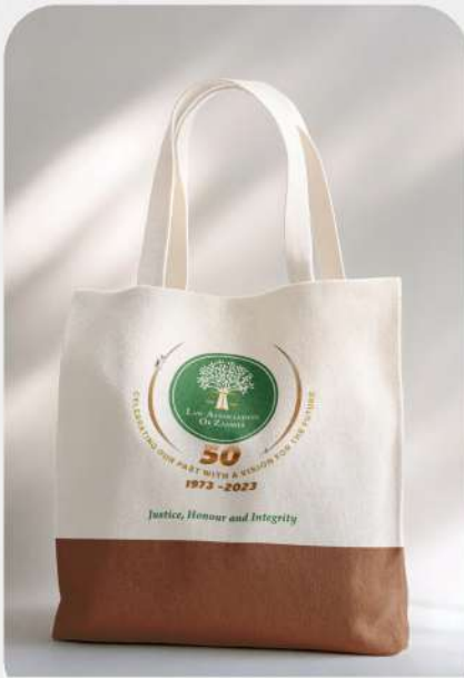
Law Association of Zambia LAZ